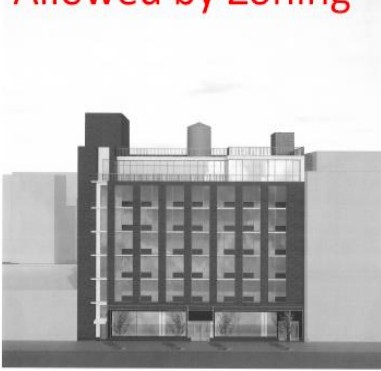
Allowed by Zoning