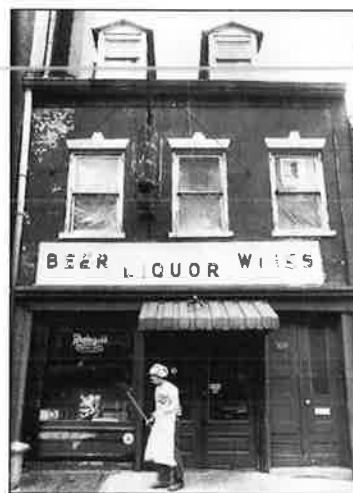
The James Brown House in 1973.

The James Brown House, home of the Ear Inn at 326 Spring Street, was built in 1817 and designated a landmark in 1969. Once located at the shoreline of Manhattan as part of a row of waterfront merchant's