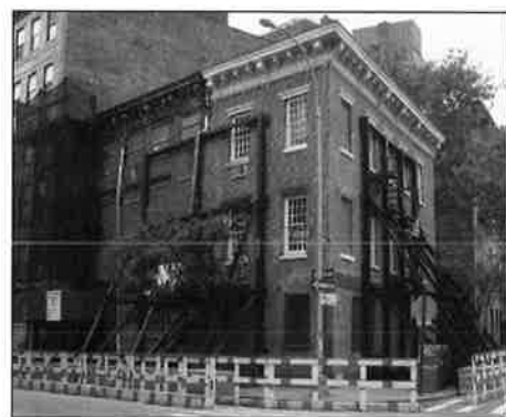
755-57 Greenwich Street/311 W. 11th Street-- 11 months later, still no sign of repairs or restoration.

GVSHP has been joined by Council Member Quinn, Assembly Member Glick, and State Senator Duane in asking that the Landmarks Preservation Commission and the Department of Buildings to meet with us to address why these buildings have been allowed to deteriorate for so long, to hope-