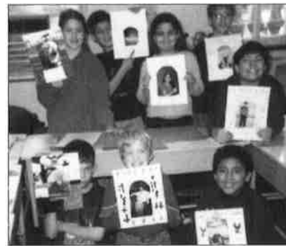
Crafts projects form a cornerstone of GVSHP's Children's Education Program.

Dramatic growth in demand for the program has brought both joy and challenges. As budget cuts have led to fewer and fewer arts-based programs in City schools, requests for GVSHP's program have soared. However, budget cuts have impacted on us as well; this year, some government and foundation grants to the