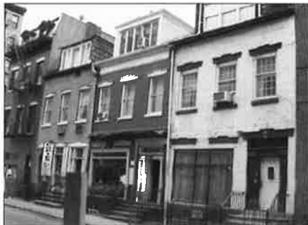
Three federal rowhouses at 127-131 MacDougal Street, among the 13 proposed for designation.

R emarkably, about three hundred Federal rowhouses still survive in Lower Manhattan. Built between the 1790's and the early 1830's in a newly created "American" architectural style, they were meant to visually reflect the identity of the young, emerging democracy. Some