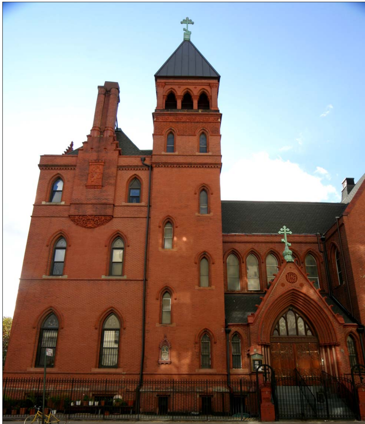
Saint Nicholas of Myra Orthodox Church East 10 th Street façade, school block