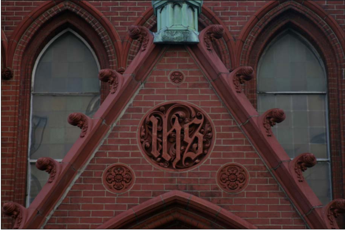
Saint Nicholas of Myra Orthodox Church Terra-cotta details, East 10 th Street facade