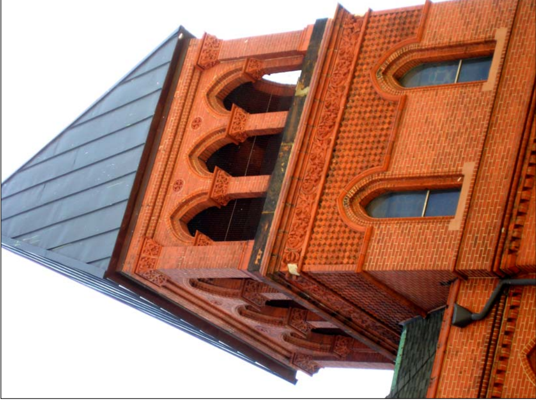
Saint Nicholas of Myra Orthodox Church East 10 th Street details