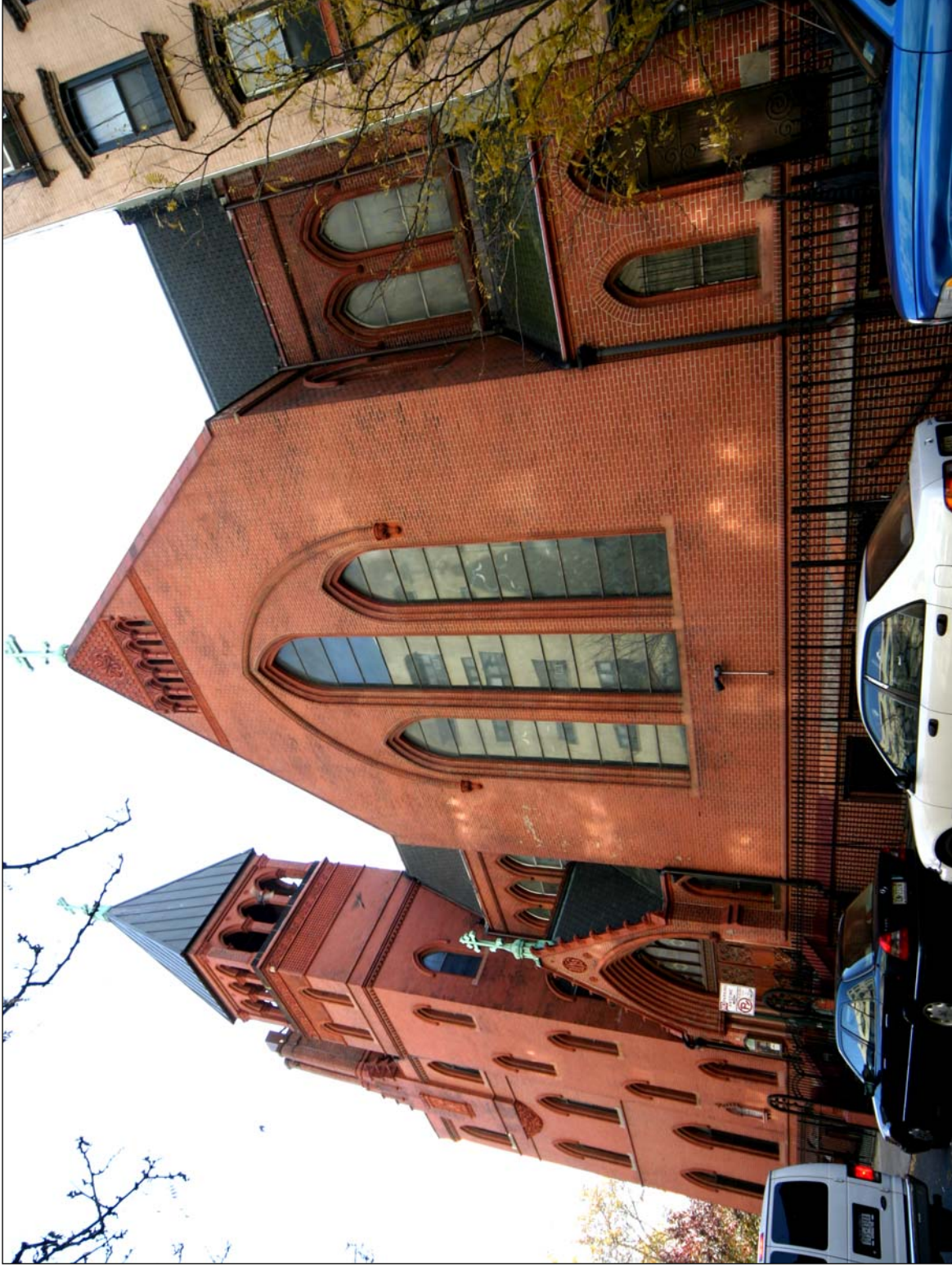
Saint Nicholas of Myra Orthodox Church