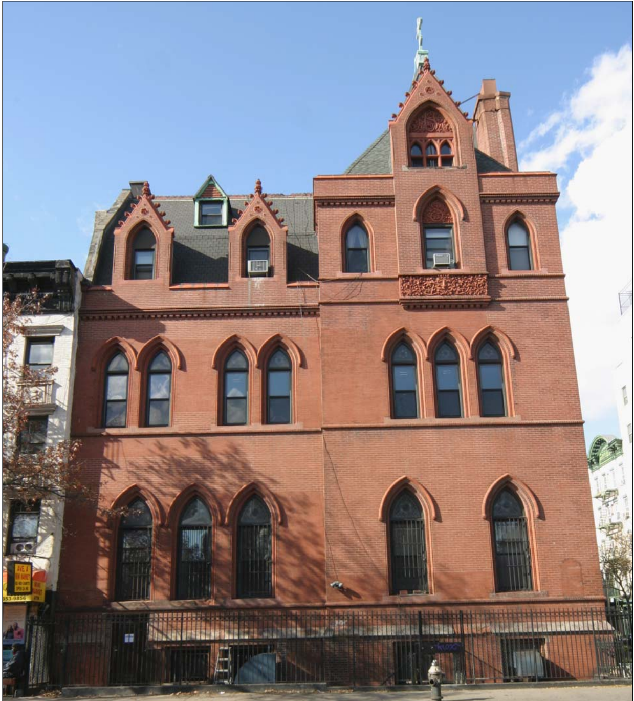
Saint Nicholas of Myra Orthodox Church Avenue A facade