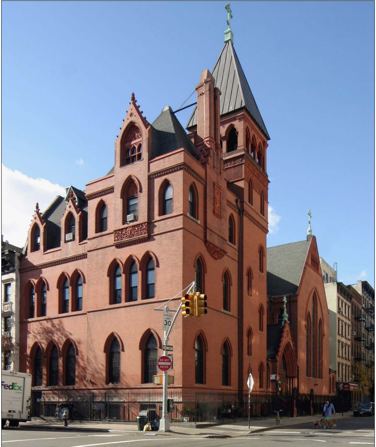
Saint Nicholas of Myra Orthodox Church 288 East 10 th Street (aka 155-157 Avenue A) Manhattan