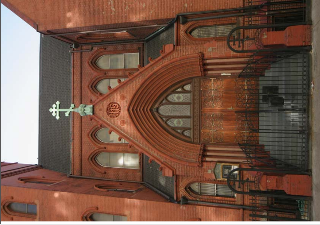
Saint Nicholas of Myra Orthodox Church East 10 th Street Façade, Sanctuary and Main Entrance