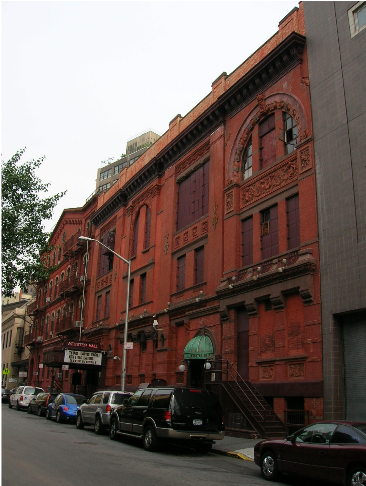
Webster Hall and Annex