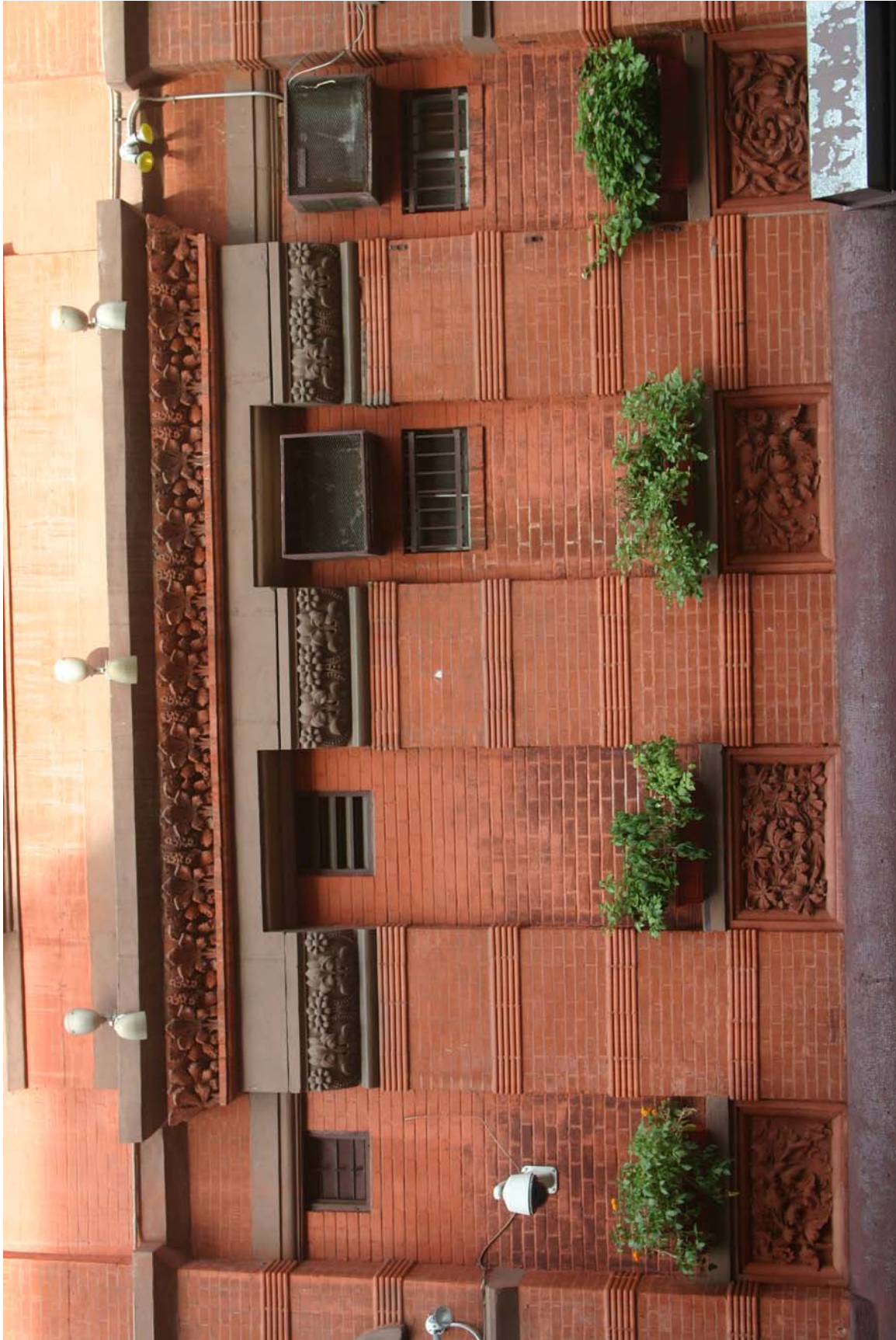
Webster Hall , first story detail