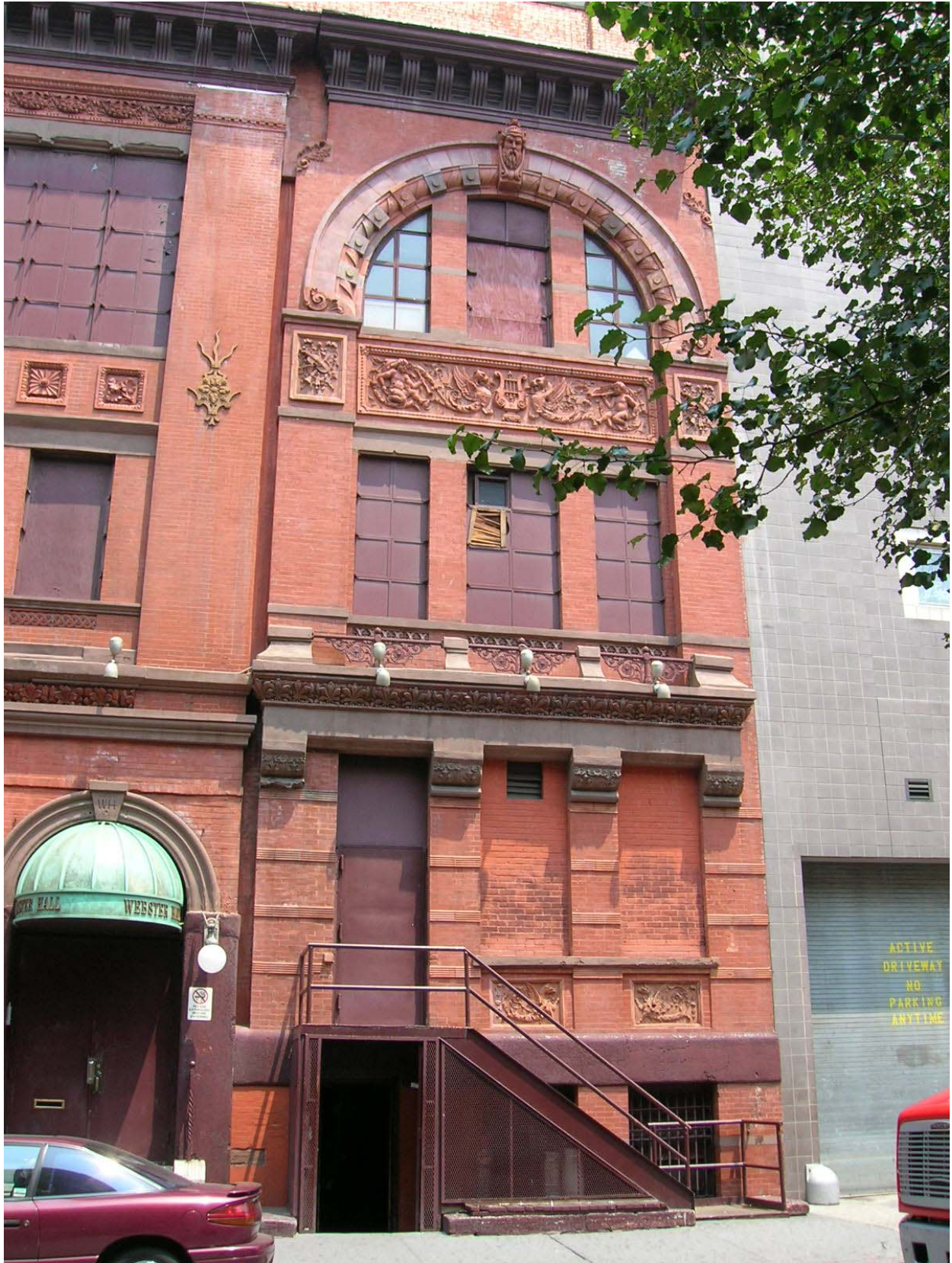
Webster Hall Annex