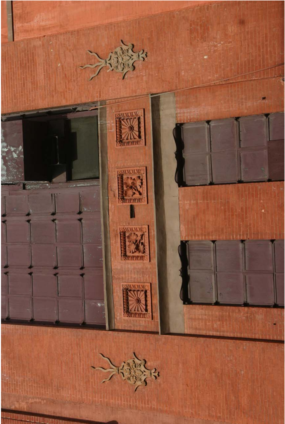
Webster Hall , second story detail