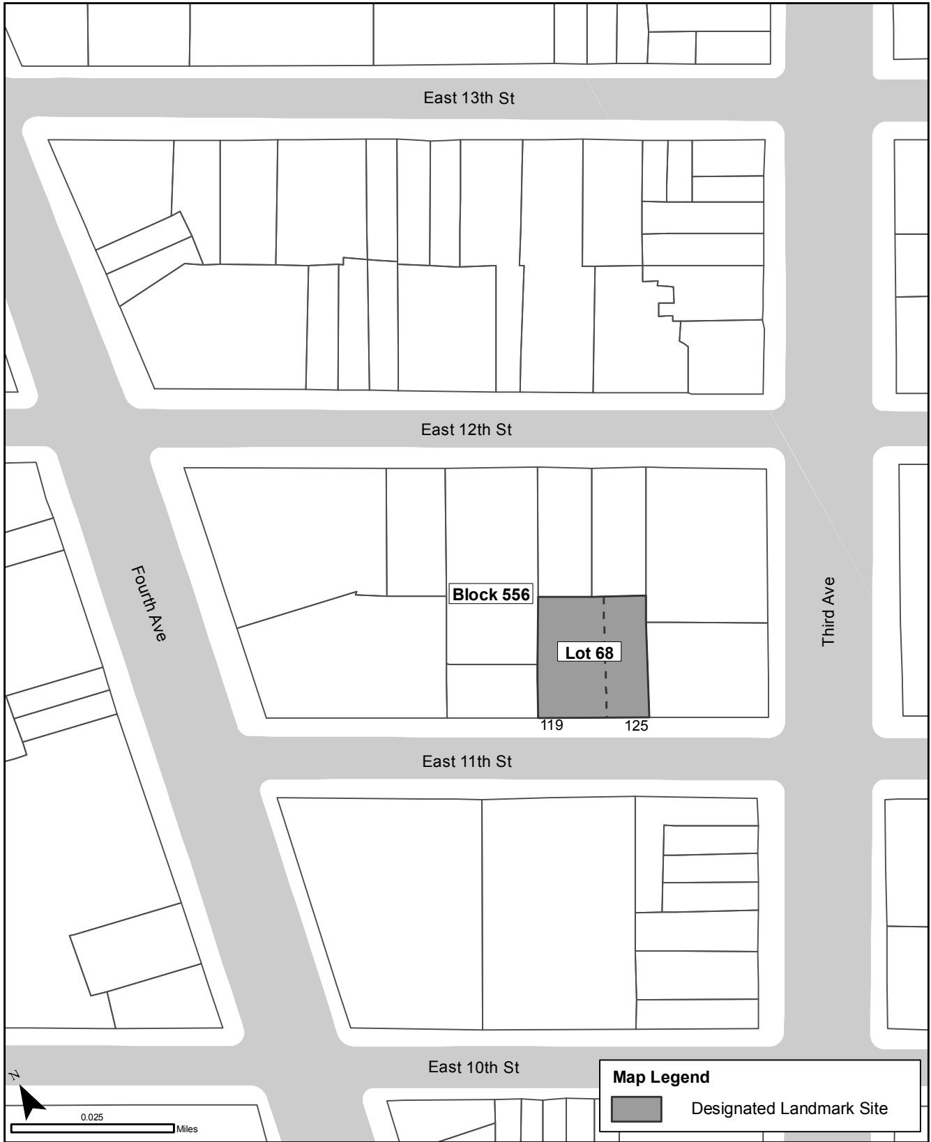
WEBSTER HALL AND ANNEX (LP-2273), 119-125 East 11th Street. Borough of Manhattan, Tax Map Block 556, Lot 68.