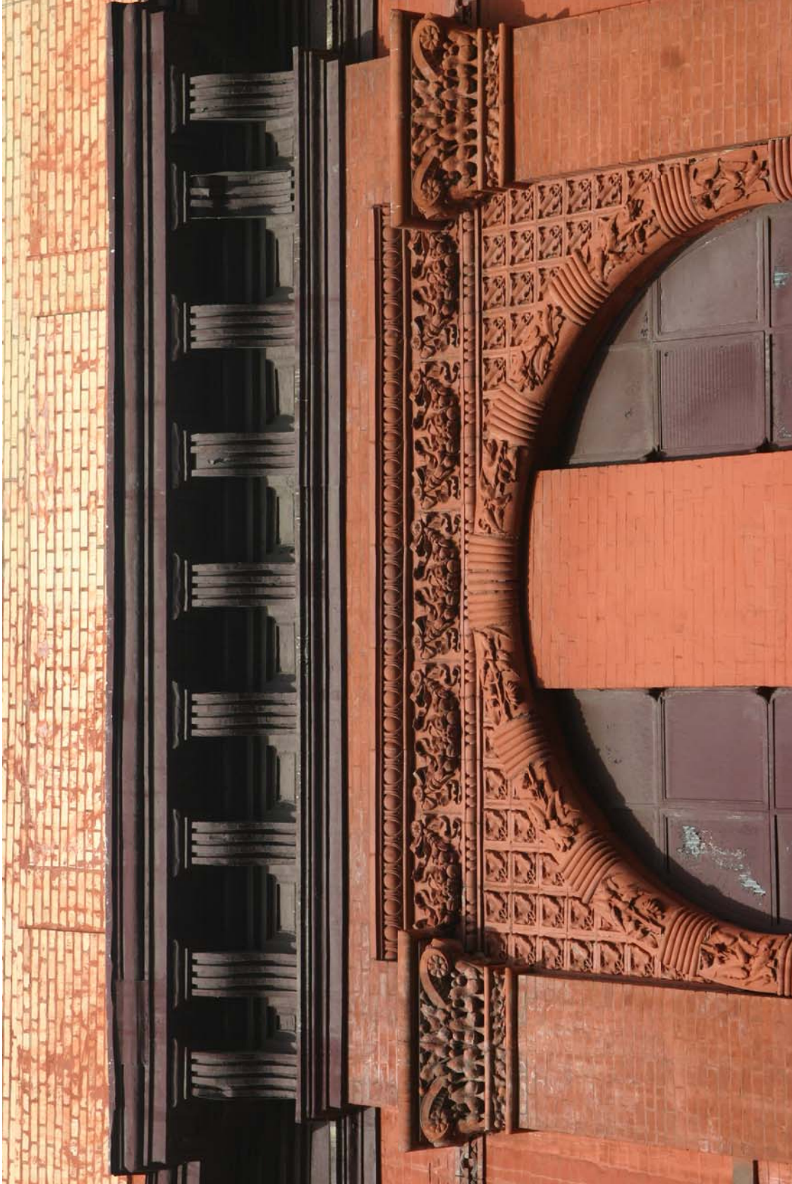
Webster Hall , third story detail