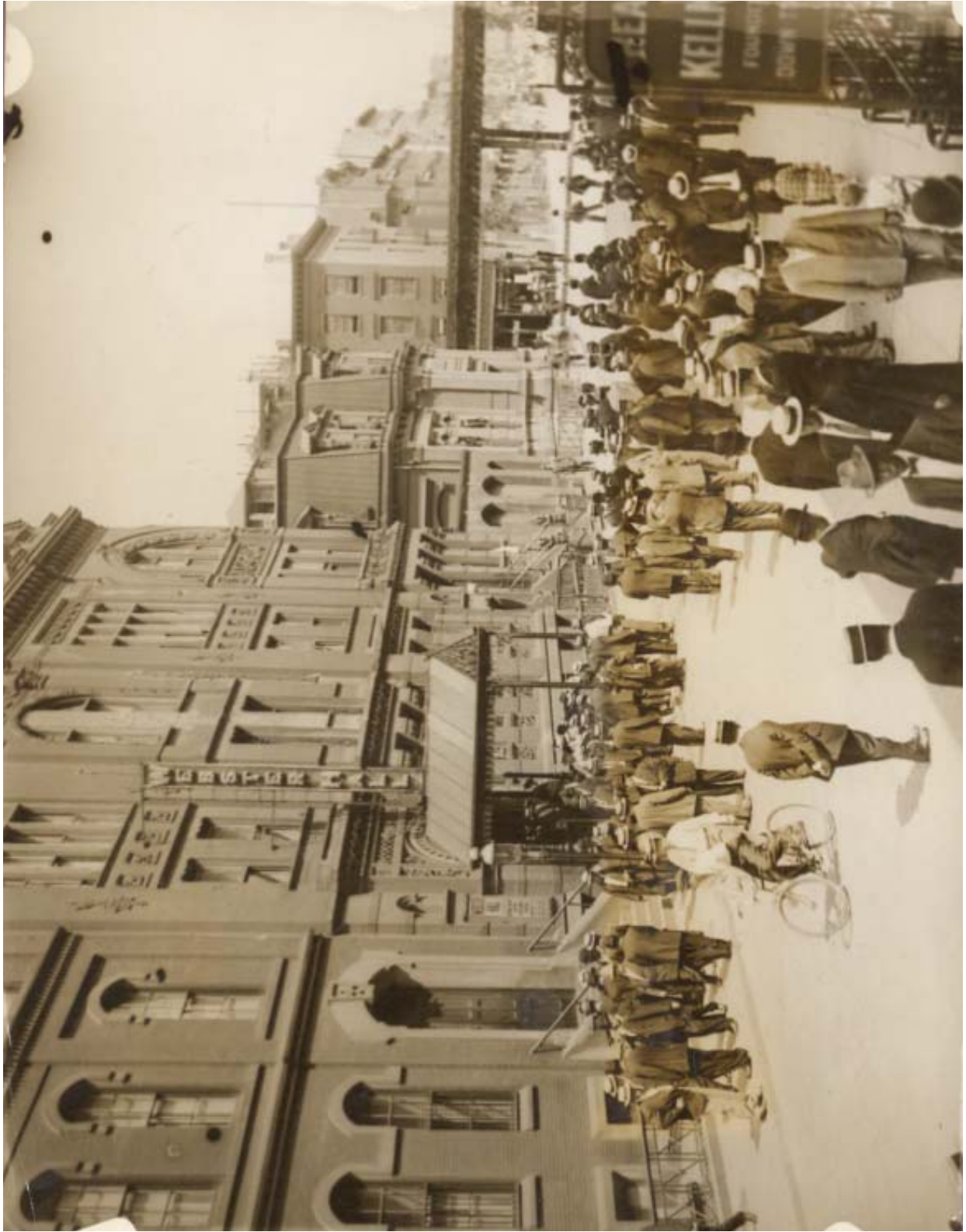
Webster Hall and Annex, 119-125 East 11th Street, Manhattan